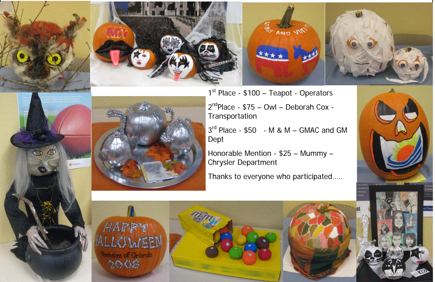
1 st Place - $100 – Teapot - Operators